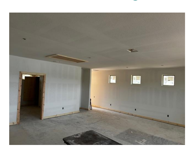
Ray Bean Cabins Nearing Completion