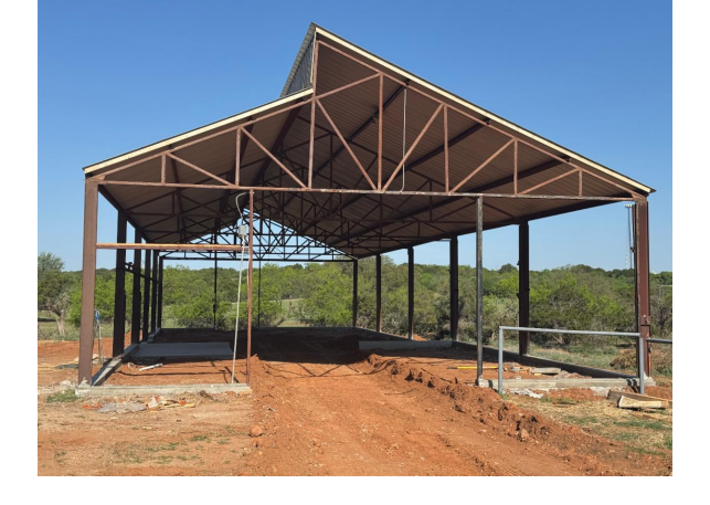
Impactful Improvements to Equestrian Facility