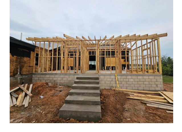
Ray Bean Dining Hall Renovations in Progress